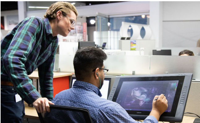
Lear Pine Grove Pine Grove, PA