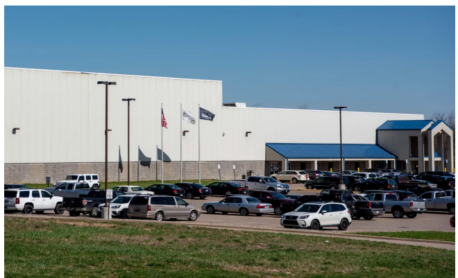
Magna CMI Highland Park, MI