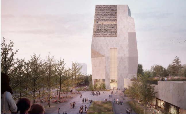
Obama Presidential Center Chicago, IL