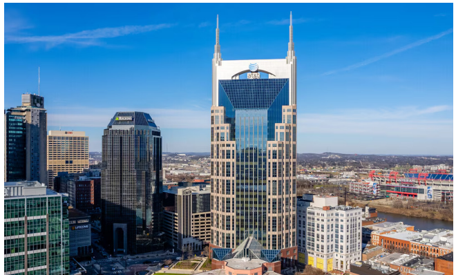
333 Commerce Nashville, TN