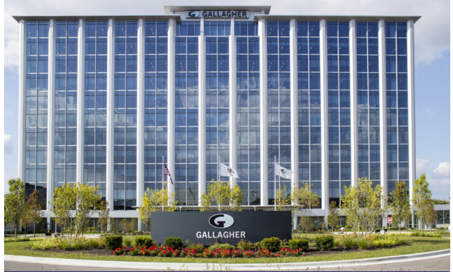
Gallagher Headquarters Rolling Meadows, IL