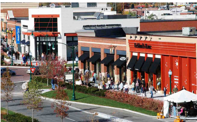
Clay Terrace Carmel, IN